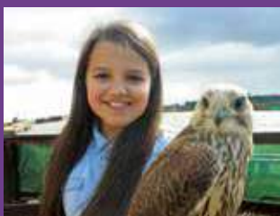
SPECTACULAR FALCONRY SHOWS