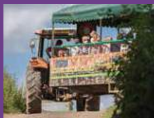
TRACTOR RIDE (SEASONAL)

"We had a fantastic day at Hatton, with our group of 5-7 year olds. The Hatton Staff were brilliant. A perfect end of year trip for this age group"