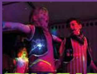
DEMONSTRATIONS AND SHOWS