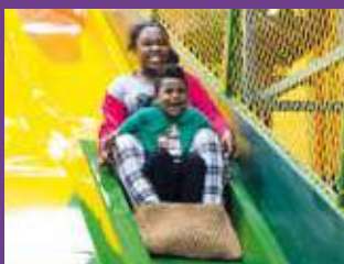
INDOOR AND OUTDOOR ADVENTURE PLAY