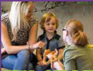
HANDS ON EXPERIENCES