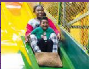
INDOOR AND OUTDOOR ADVENTURE PLAY