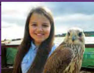
SPECTACULAR FALCONRY SHOWS