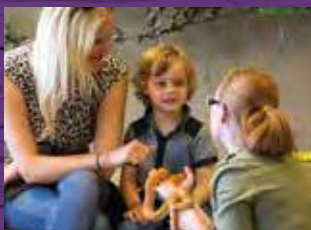
HANDS ON EXPERIENCES