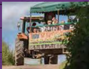
TRACTOR RIDE (SEASONAL)

"We had a fantastic day at Hatton, with our group of 5-7 year olds. The Hatton Staff were brilliant. A perfect end of year trip for this age group"