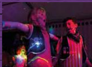
DEMONSTRATIONS AND SHOWS